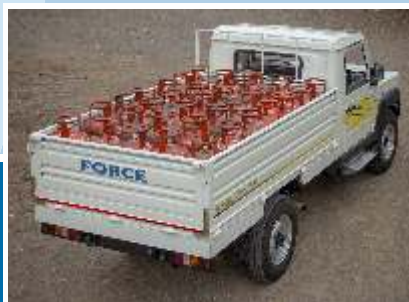
LPG Cylinder Carrier Application