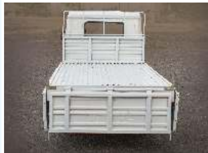
Flat Bed with 3 Side Opening Cargo Space