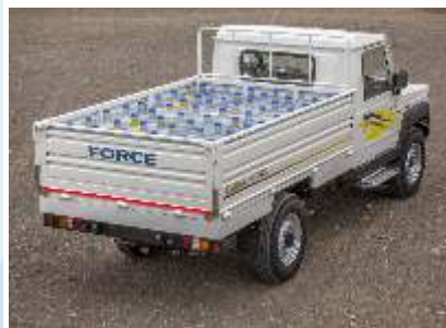
Water Bottle Carrier Application