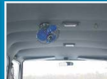
Fan & Adequate Lighting