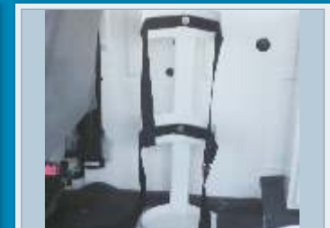
Oxygen Cylinder Brackets

NOTE : On account of continuous Research and Development, specifications are subject to change. The data included herein is to be regarded as approximate. Accessories shown may not necessarily be part of standard equipment.