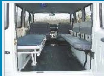
Spacious Stretcher & Seating for Attendants