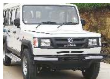
New Improved front styling