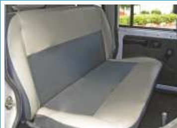
Spacious & comfortable middle seat Good Leg / Head / Shoulder Room