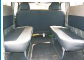
Ample leg room & luggage space