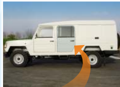
Only Vehicle to have Kerb Side Delivery Option