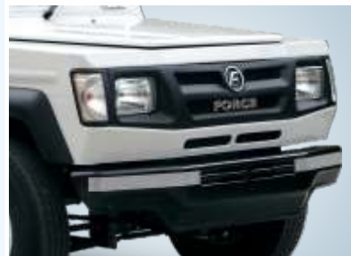
New Improved front styling