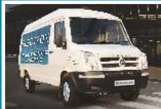
Large Branding Area