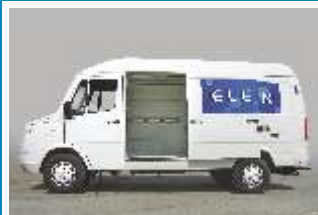
Sliding door for kerb side delivery (Optional)