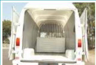
270° opening twin leaf Rear Doors for easy loading & unloading

The Traveller Variants now come with Anti-Lock braking System (ABS) with Electronic Brake-force Distribution (EBD) for best in class safety. The ABS prevents wheels from locking when braking on a slippery or winding road. The EBD ensures brake force distribution taking into account the load on each of the wheels and helps to shorten the stopping distance.