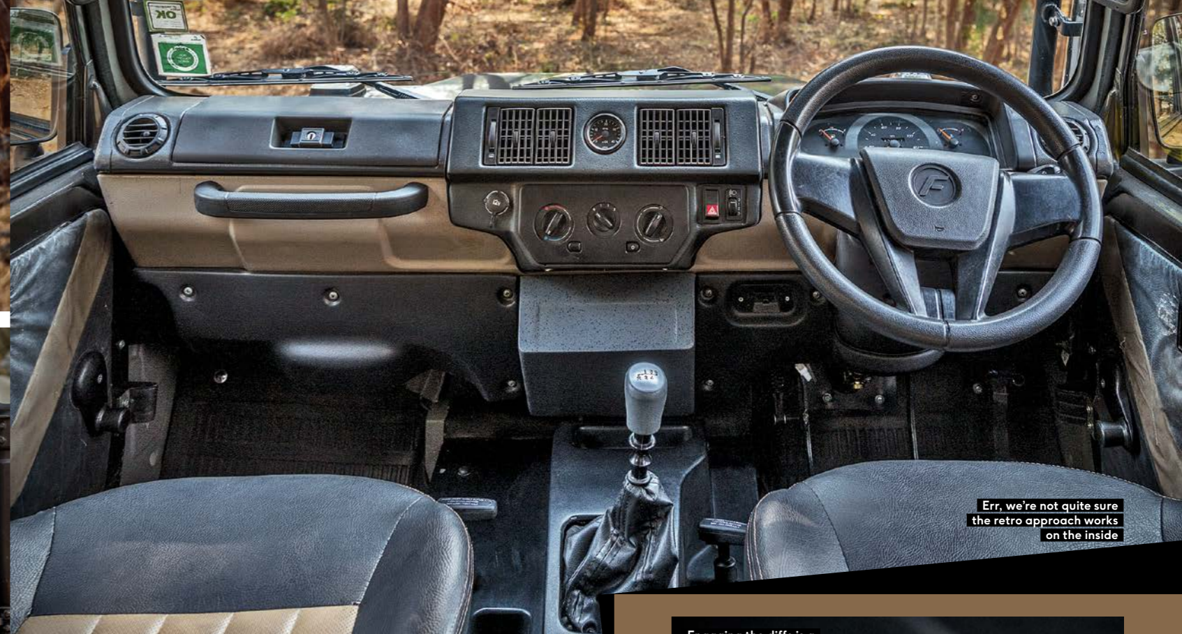
Err, we're not quite sure the retro approach works on the inside

“THE GURKHA IS BUILT TO TACKLE TRAILS, AND WILL CREATE THEM WHERE THEY DON'T EXIST”