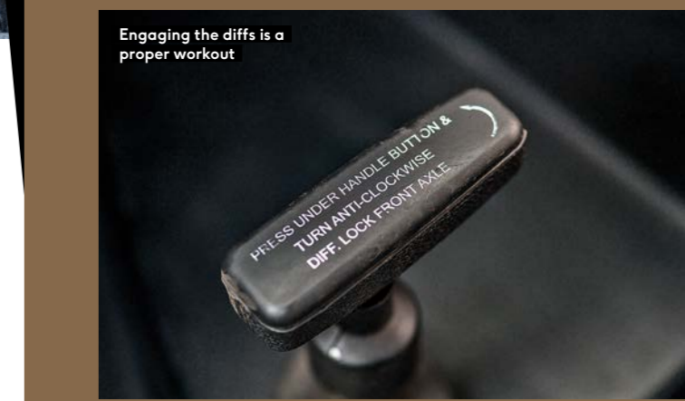
Engaging the diffs is a proper workout

Gurkha. The new drivetrain significantly improves the way it drives on tarmac too. However, it still isn't perfect. The cabin has been given as much attention as Donald Trump gives gun laws in the US. When you're in the driver's seat, it still feels crude and truck-like. Yes, this isn't the sort of SUV that you look to for luxury, but the cabin design sorely needs an update to look more contemporary – the retro design might work on the outside, it really doesn't on the inside.