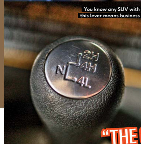
You know any SUV with this lever means business